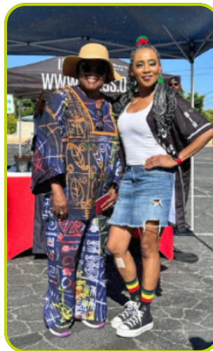
SDA Mt. Rubidoux Church Juneteenth Event