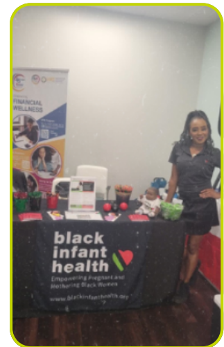
Community Action Partnership (CAP) Meet and Greet