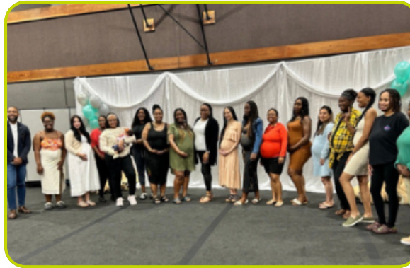
SDA Mt. Rubidoux Church Community Baby Shower